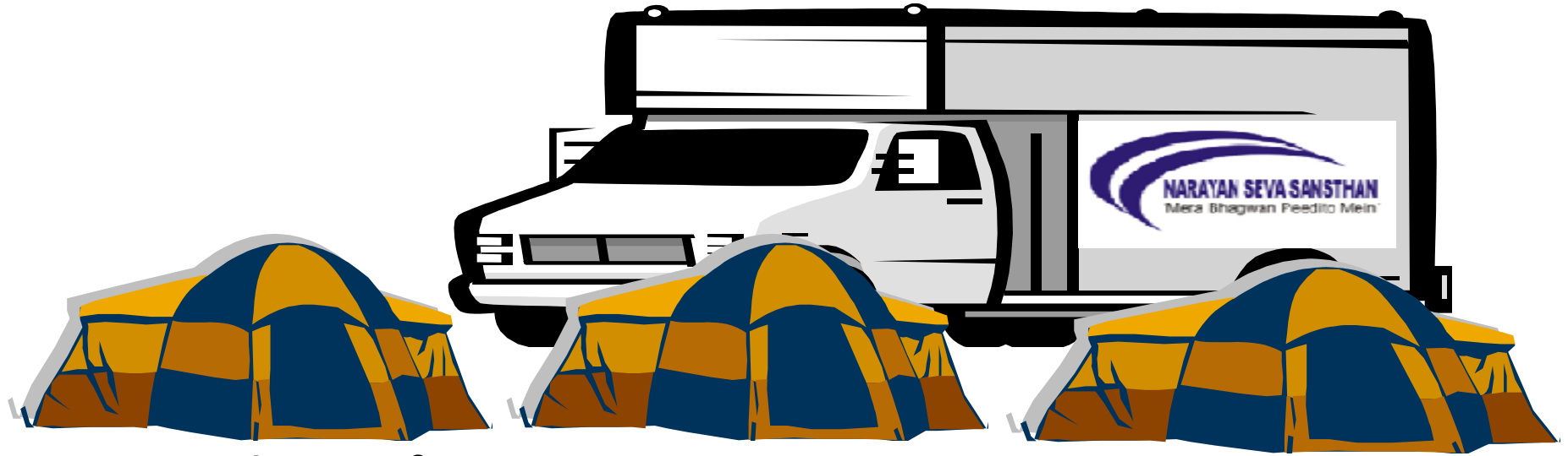
Assessment & Evaluation Camp