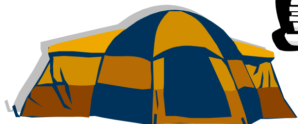
Measurement / Casting & Modification Area