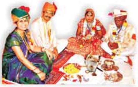
Complete Kanyadaan (Per girl)

Become parents of Divyang girls & do Kanyadaan