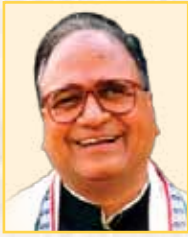
Hon. Kailash Agrawal "Manav"