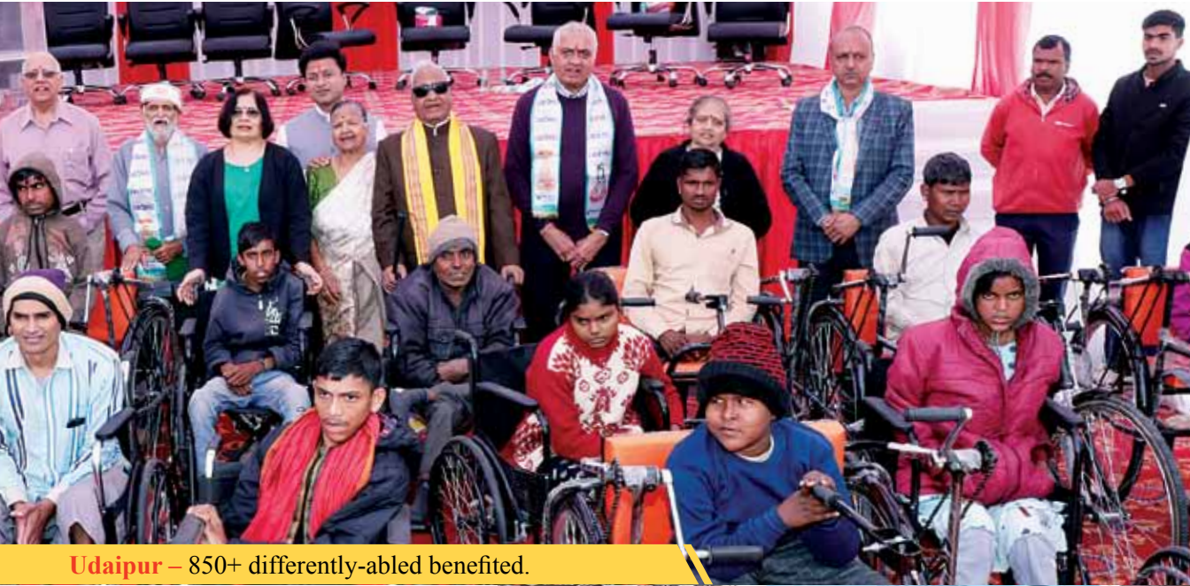
Udaipur – 850+ differently-abled benefited.

On the auspicious occasion of Makar Sankranti , countless acts of kindness were carried out.