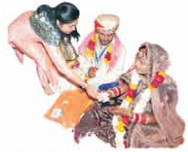
Partial Kanyadaan (Per girl)