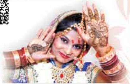
Mehndi Ceremony (Per Couple)