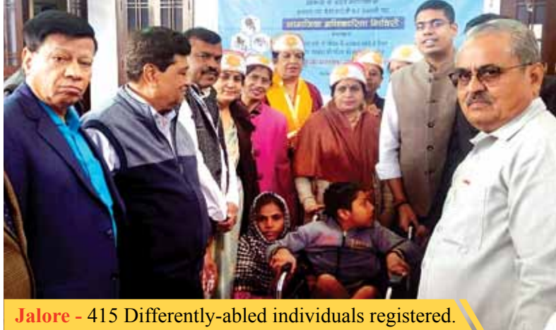
Jalore - 415 Differently-abled individuals registered.