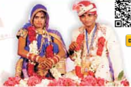
Paanigrahan Sanskar (Per Couple)