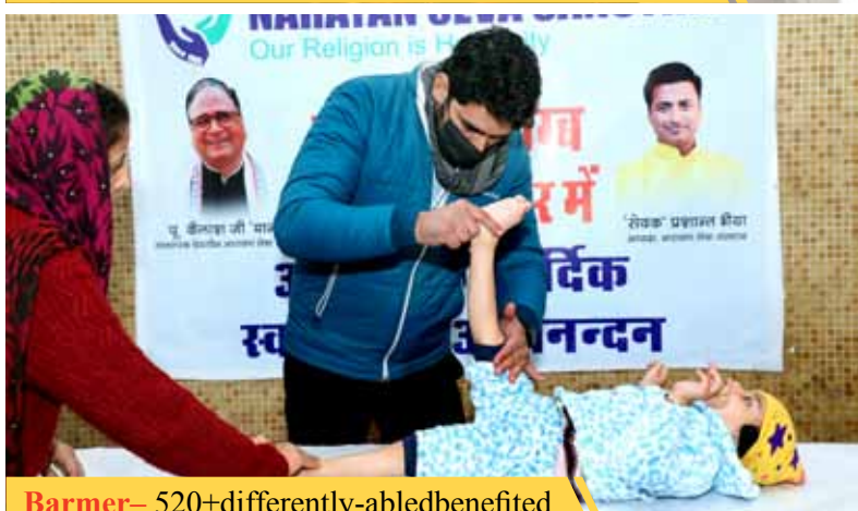
Barmer – 520+differently-abled benefited.